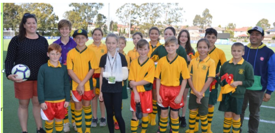
Our mixed PSSA soccer team before their first game. Congratulations everyone!