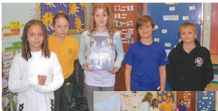
This group read 'The Feather and played a game with their group.

Please remember to send fruit or vegetables to school for our fruit